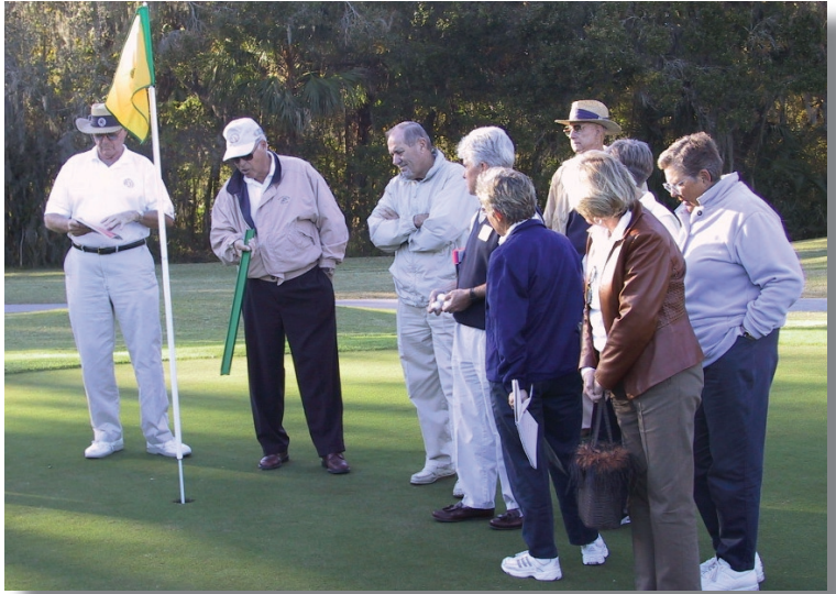
Course Rating Captains and Co-Captains took the meeting outside to measure green surfaces.

In conclusion, the event was a great success and allowed all Captains and Co-Captains to gather and share ideas and learn new things for the upcoming year.